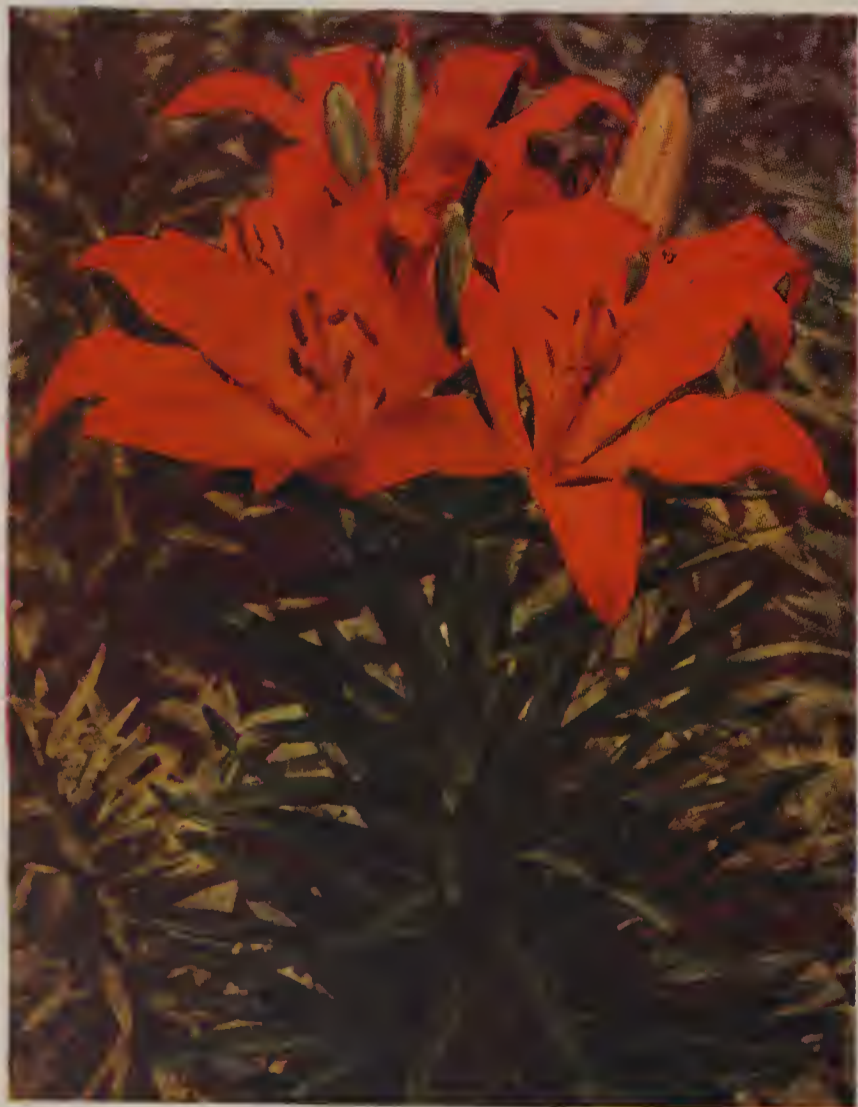
Lilium umbellatum grandiflorum erectum Vivid orange-scarlet. June-blooming For description, see page 26

20 bulbs, 5 each of 4 varieties (value $4.30) $3.50 • 40 bulbs, 10 each of 4 varieties (value $8.55) $6.50